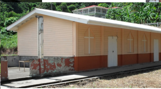
St. Luke Anglican Church, Grenville Vale, St. George's Grenada