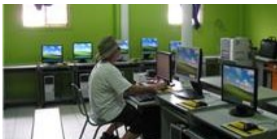
← Bishop's College, Kingstown, St. Vincent Computer Lab