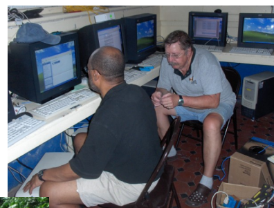
→ Computer Lab being set up in St. George's Anglican Primary School, Grenada