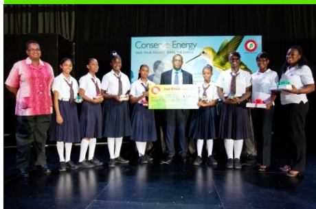
GRENLEC's CEO presents second place awards to the Anglican High School

The Anglican High School, Grenada placed second in the National Energy Debate sponsored by the Grenada Electricity Company. The School debated against the topic 'Be it resolved that it is economically viable for Grenada to invest in energy efficiency rather than renewable energy' . The team addressed alternative energy as an initiative that would reduce Grenada's fuel import bill on volatile fuel imports that drive energy prices up.