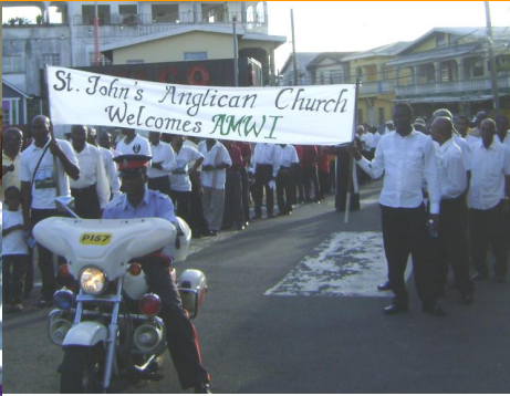
Procession lead by Police Escort through Gouyave street