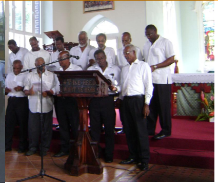
Men from the Parish of St. Patrick giving a Singing Presentation

T he Anglican Men of the West Indies (AMWI) held its 7th annual Convention in the Archdeaconry of Grenada from 18th - 20th November, 2011, under the theme 'Rekindling the Spirit of God in Men for Discipleship'.