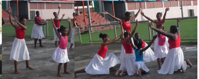
Groups Performances at the Advent Mission Youth Rally