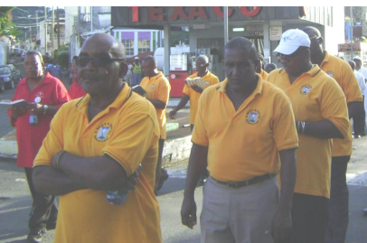
Procession of witnessing through the streets of Gouyave in the Parish of St. John

Sessions were conducted daily at the Player's Conference Room at the National Stadium. AMWI encourages all men especially at the approach of the New Year to focus on the theme and become disciples for God.