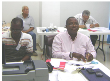
AMWI Secretariat hard at work