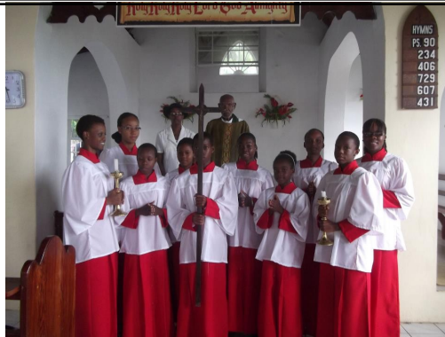
Newly commissioned servers at St. Sylvan's Church, Stubbs, Parish of St. Matthew Biabou,

The life and future of any church rest not only in its present adult members but the future adults who are the youths of today. Likewise the bishops, priests and deacons of tomorrow are the Sunday school students, youth group members and altar servers of today. It is therefore very important to open to these young persons to the teachings of the church.