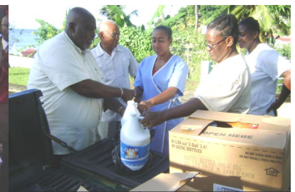
Presentation of items to the Hillsborough Home for the Aged, Carriacou