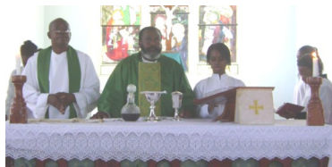
Celebrant and Preacher Archdeacon Glasgow