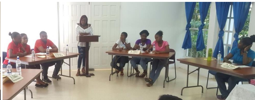
Quiz in session